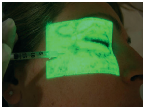
Figure 1. Direct use of near-infrared device during botulinum toxin injection for periorbital rhytids.

The device has been used in two ways: direct use during the injection process (Figures 1 and 2) and using the device to map the vessels before the pro-